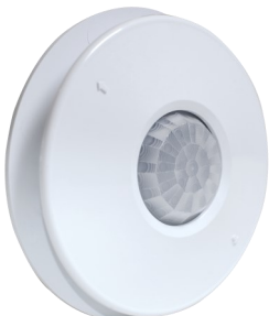
RECESSED MOUNT CONFIGURATION

Touché Controls (a Product of ESI Ventures)