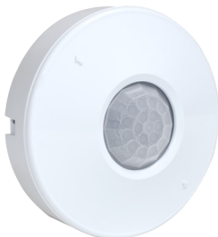
SURFACE MOUNT CONFIGURATION